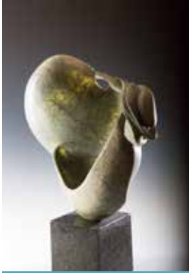
Carl Nelson "Smooth&Tumbled" Olivine 24 in. x 16 in. x 12 in. $3600