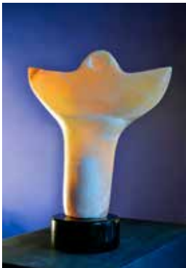
Sue Quast "Guardian" Alabaster 14.5 in. x 11 in. x 5 in. $950