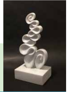
Rafael Sebba "Rebirth" Marble 16 in. x 8 in. x 6 in. $2400