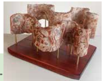
Allan Sieradski "The Colorado River" Marble 15 in. x 24 in. x 18 in. $2600