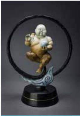
M. David Pendragon "Wisdom" Bronze 13 in. x 10 in. x 6 in. $3450