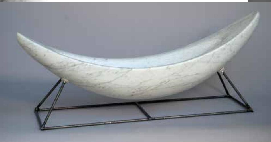
▲ 'CRADLE', 33" X 12" X 9", 2013, CARRARA MARBLE