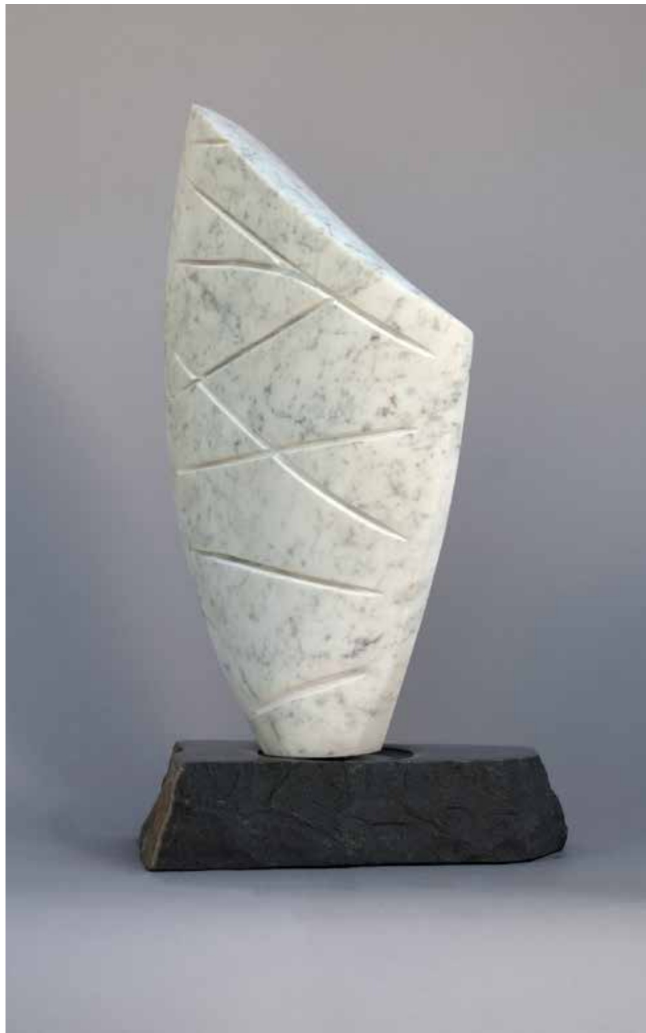
▲ 'STITCHED', 21" X 11" X 6", 2012, MARBLE