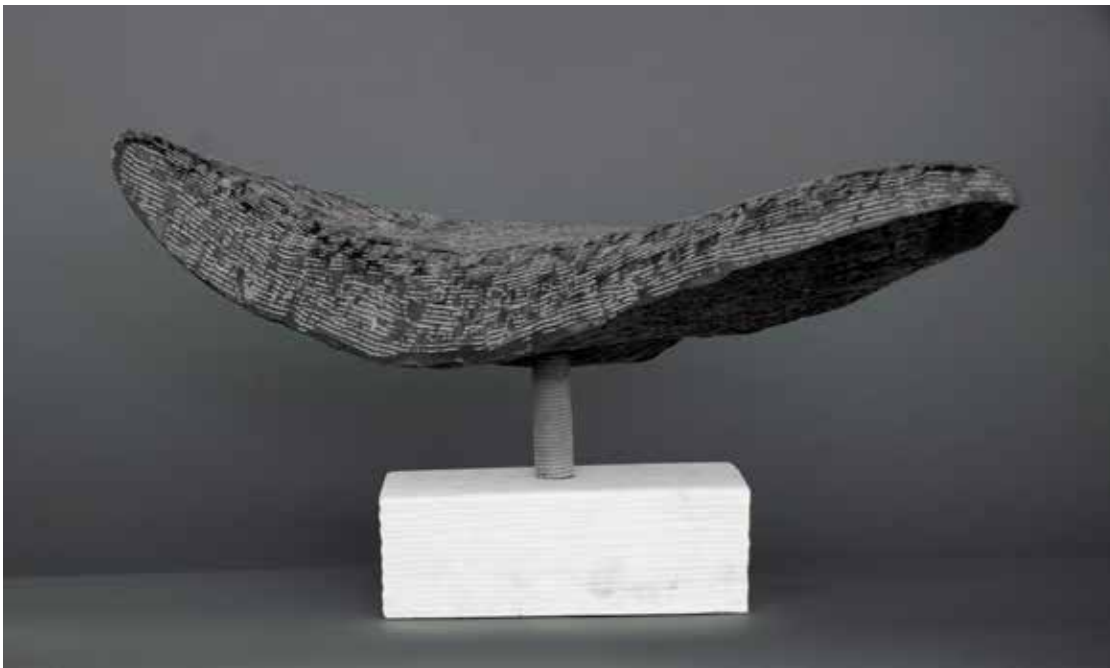
▲ 'FLUKE', 15" X 30" X 11", 2012, BELGIAN BLACK MARBLE

or that particular stone into a pleasing sculpture. A recent piece is a great example of this. I had this black Belgian marble spire standing vertically in my rock pile for about 8 years. When I looked at the stone I couldn't figure out what to do with it – the lean of the stone was difficult. When I moved my studio the stone went into a pallet box on its side. Seeing the stone lying sideways gave me the radical idea to carve a horizontal form. I had not previously thought in horizontal forms, but in less than 10 hours of chiseling I had a very pleasing horizontal form at hand. It took well more than that to figure out how to mount and present the