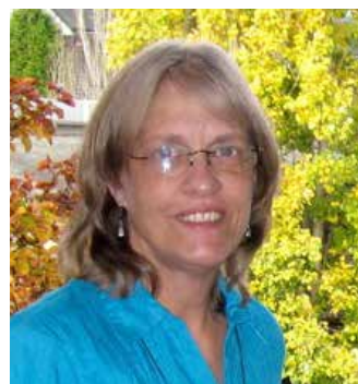
First Time at Silver Falls ... 10