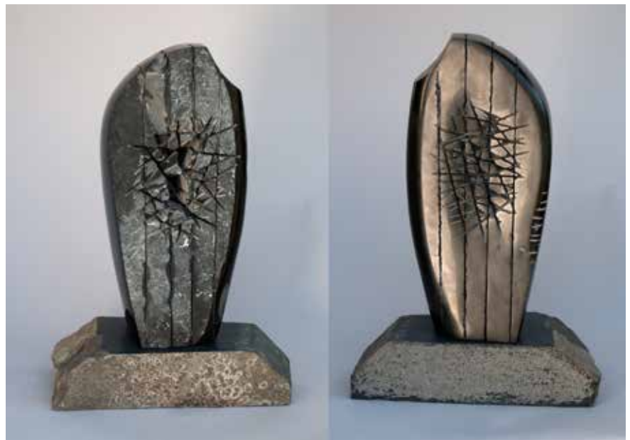
▲ 'SLICE', 22" X 15" X 7", 2013, BELGIAN BLACK MARBLE

My annual volume is highly size-dependent. I have about 300 hours/year that I devote to my sculpture, which I would like to double over the next year or two. So a single 200-hour piece will take up a big portion of my year’s output. When I am feeling stressed for time I tend to work smaller because it gives me the feeling I am accomplishing more. When I was working on building my studio I had no extra time to create sculpture, so I didn’t worry about marketing and showing. Now that I have no other distractions I have been showing at SHIFT Cooperative in Pioneer Square. I work well to deadlines, so take advantage of the imposed show schedule to improve my productivity.