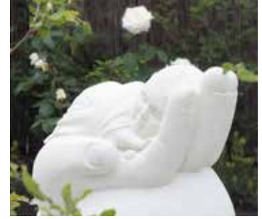
▲ 1.) 'TUATARA', 14" LONG, OAMARU STONE (ABOVE); 2.) 'UNTITLED', 20" HIGH, OAMARU STONE (TOP RIGHT); 3.) 'CRADLED IN THE LORD'S HAND', 39" HIGH, OAMARU STONE (BOTTOM RIGHT)