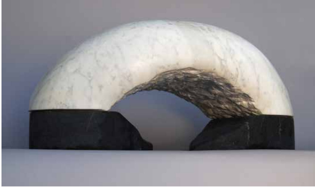
▲ 'STRETCH', 24" X 11" X 11", 2013, WHITE MARBLE

I spend a lot of time looking at images, whether they are human forms, natural objects or manmade creations. My main use of Facebook, for example, is to scroll through all the images that are posted. I am in a phase right now where I am drawing quite a bit from animal forms. I have been a beekeeper for the last couple years and have been trying to find a way to use any of the fascinating bee-made patterns in stone. I stumbled across a way to do this while I was fret cutting last week, so am looking forward to that as my next piece.