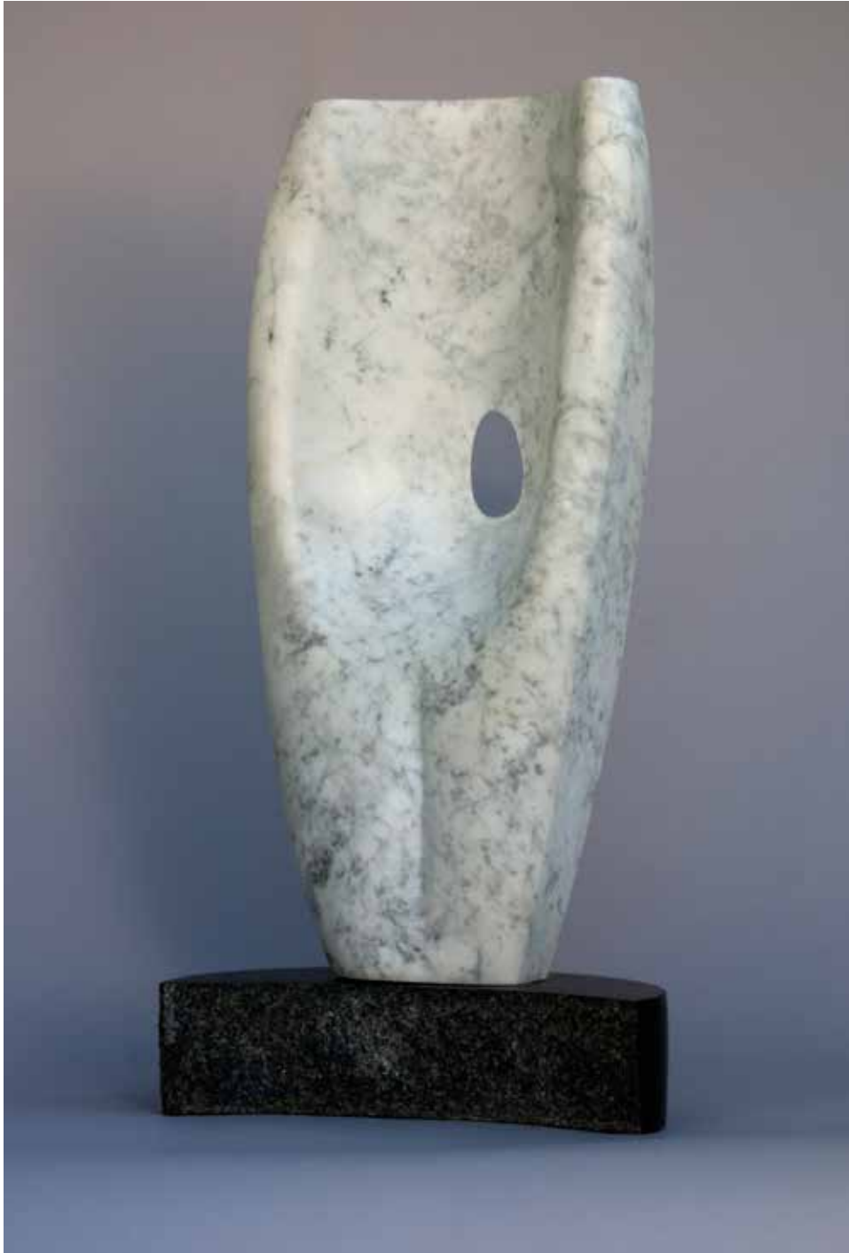
KEN BARNES: 'CORONA', 24" X 12" X 5", 2013, WHITE MARBLE