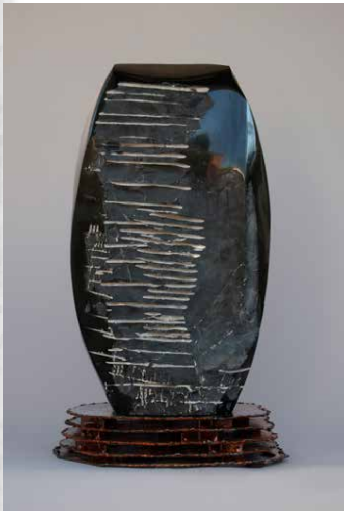
▲ 'POD', 25" X 13" X 9", 2013, BELGIAN BLACK MARBLE

Human scale is my favorite size – 6 feet tall. However, I mostly work in the 100lb or less size, since it is so much easier to move around. I’ll typically have one large piece in progress along with one new smaller one and another one or two re-works – pieces that I decided after display somewhere that they need some tweaks.