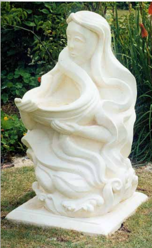
▲ 'GODDESS OF FLORA', 40" HIGH, OAMARU STONE