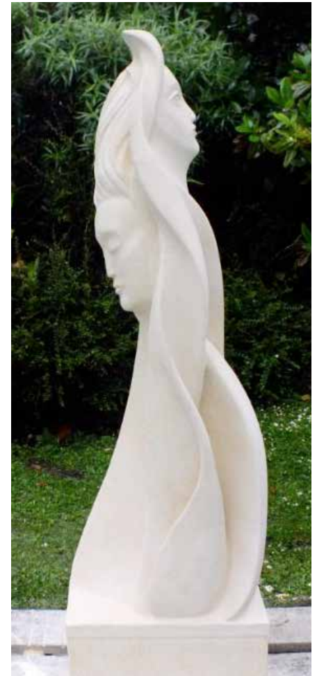
▲ 'REFLECTION', 59" HIGH, OAMARU STONE