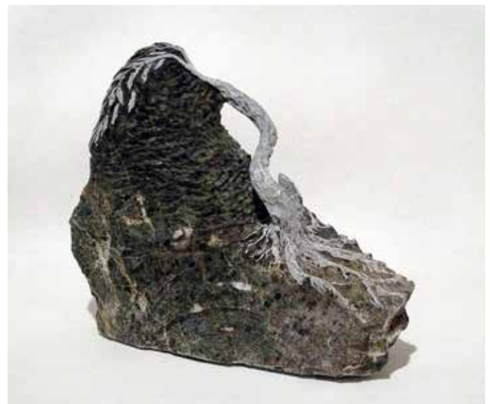
▲ 'NEW WORLD', 9" x 10" x 5", SOAPSTONE, 2014

The first, 'Lost World', is a tree with two trunks emerging from the stone and winding around each other, leading to highly polished foliage flowing back into the rough, pale rock. Its companion piece, 'New World', is a photographic negative of the first work: a pale, shattered, single trunk that rises out of the dark rock and ends in pale, sparse foliage scattered across the top. The first symbolized the richness of my life with Judy while the second was my bereavement in a new world that lacked strength and substance.