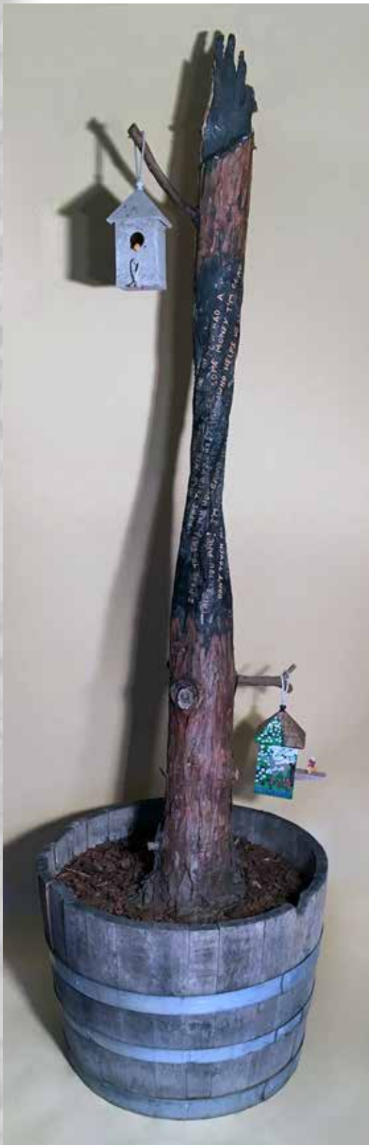
▲ 'PHOENIX', 94" H X 24" DIA, WOOD, STEEL, WOOD ASH, POLYMER CLAY, ACRYLIC PAINT, BARK, 2016