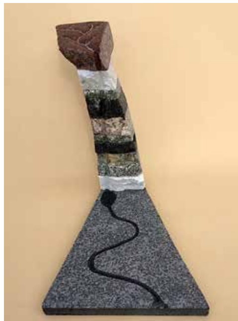
▲ 'TIME', 10" x 11" x 8", MIXED STONE, 2019

This summer I did a sculpture, 'Time', based on a vision that woke me in the middle of the night. It seems to be a contemplative look at time and change and has nothing to do with grief. It was a real delight to make. I'm now inundated with a range of ideas and a desire to work with a variety of materials. I'm looking forward to this new era in my sculptural life.