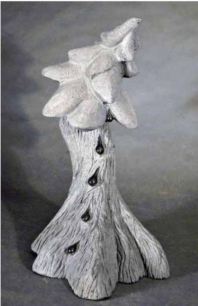
▲ 'THE TREE OF LIFE IS WATERED WITH TEARS', 18" x 14" x 10", BASALT, 2014