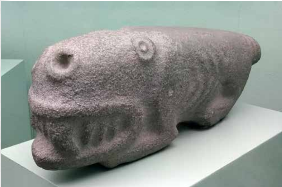
▲ CREATURE CARVING