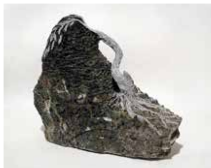
Artist Spotlight: Kirk McLean ... 4