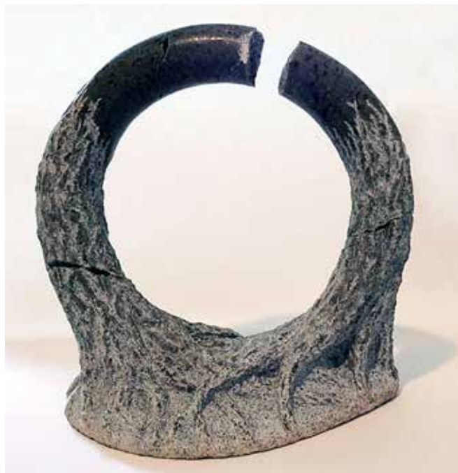
▲ 'WILL THE CIRCLE', 12" x 11" x 6", OLIVINE, 2014

thinking played a major role: a nub of an idea would start a cascade of related ideas that I then would try to integrate into a coherent whole.