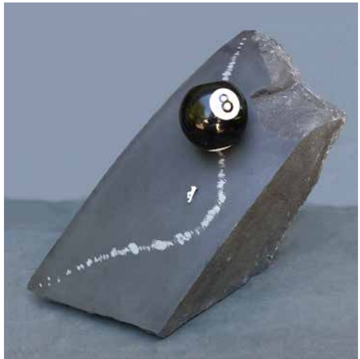
▲ 'CAREGIVER FINDS RESPITE', 13" x 15" x 12", BASALT, BARITE, MAGIC 8 BALL, 2015

'Caregiver Finds Respite' came together from several thoughts. The flat face of the wedge-shaped basalt gave me the idea of using stone as a support for a narrative rather than carving it. I connected it with the myth of Sisyphus and how, as a caregiver, I woke up each morning feeling I had to roll the stone up the mountain, only to start over the next day. The eight ball in place of the stone popped into my mind from the phrase "behind the eight ball," meaning you were stuck. It morphed into the Magic 8 Ball of my youth with its ambiguous answers reflecting the constant uncertainty of caregiving. I made three different figures over the course of completing the piece, each progressively smaller as I reflected on the enormity of the daily task. The figure is taking a break from his labors, but briefly, and in a very precarious place.