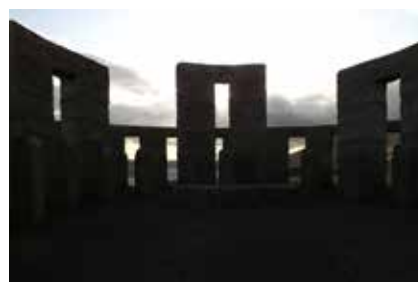
The Museum and the Henge ... 10