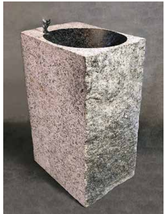
▲ 'IF (YOU REALLY LOVE ME)', 14.5" x 8.5" x 6", GRANITE, 2018