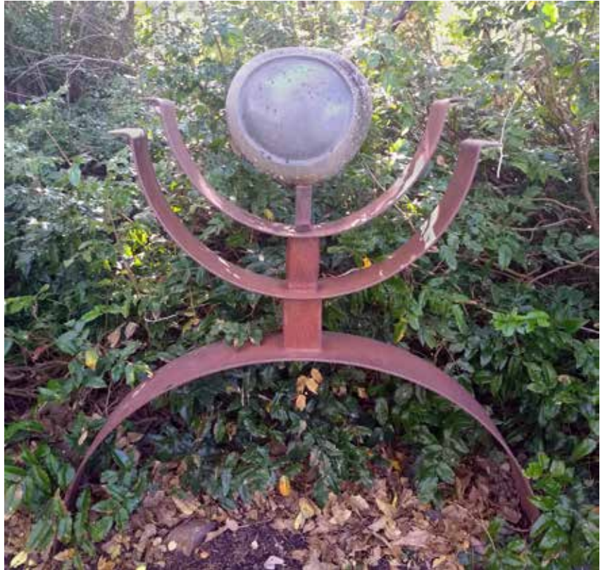
▲ 'MOON TEMPLE', 2006, LEON WHITE'

Spread out around the exterior of the museum, one can discover the outdoor art collection. A large concrete sculpture installation is sited within an overlook garden,