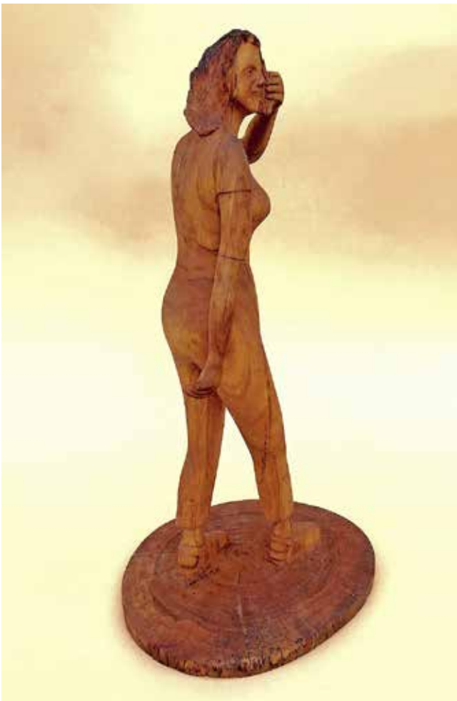
▲ 'THE NEW NORMAL', 12" x 6" x 7", CHERRY WOOD, 2019

Completing the series really did yield the hoped for result: I made the transition into another world that is no longer about grief and memory. I imagine that the passage of time has much to do with this outcome, since it's been six years, but I also think that my self-imposed art therapy played an important role. At a minimum, I've been able to transform the lead of grief into the gold of expressive sculpture.