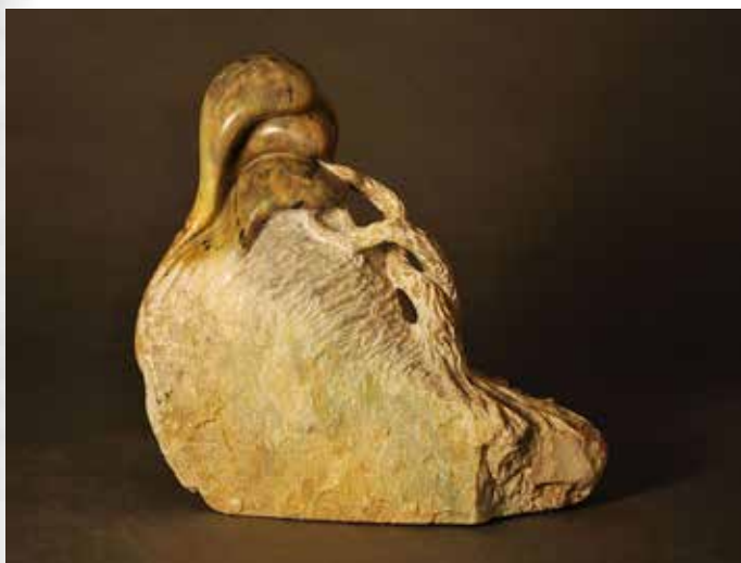
▲ 'LOST WORLD', 12" x 10" x 5", SOAPSTONE, 2013

After the Green Art show, I shifted the series away from using trees and used a variety of forms. In these, associative