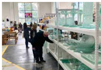
Making Space ... 8