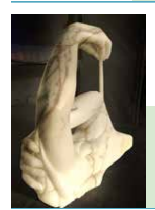
Cyra Jane "Reconcile (The Mother)" Marble 18 in. x 7 in. x 18 in. $4800