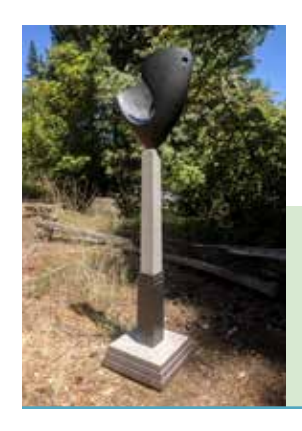
Jeremy Kester "Lunar Tide" Basalt, Granite 68 in. x 18 in. x 16 in. $6800