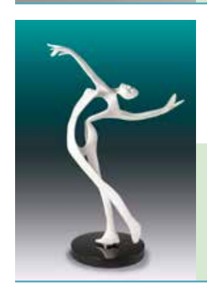
Harold Linke "Mountain Spell" Bronze 22 in. $2945