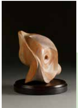
Kim Lewis "New Dancer" Paraphylite Stone 11 in. x 9 in. x 9 in. $1600