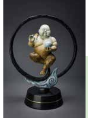
M.David Pendragon "Wisdom" Bronze 13 in. x 10 in. x 6 in. $3450