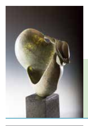
Carl Nelson "Smooth&Tumbled" Olivine 24 in. x 16 in. x 12 in. $3600