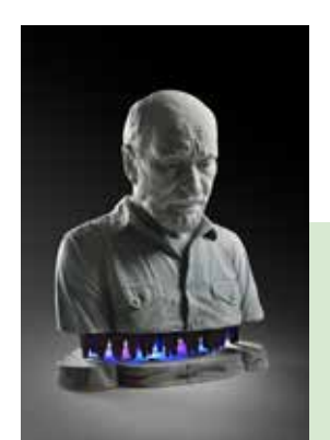
Nancy Bocek "Divided" Mixed Media 17.25 in. x 9 in. x 13.5 in. $1800