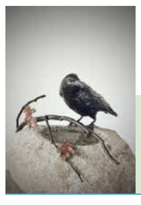
Michelle Berlin "Autumn Crow" Bronze, Granite 16 in. x 18 in. $4700