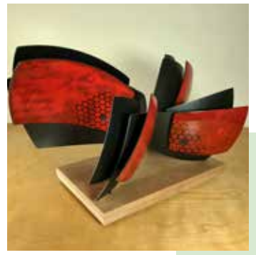
Tom Hynes "Butterfly" Enameled Steel 18 in. x 12 in. x 14 in. $2300