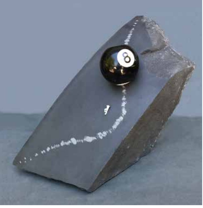
▲ 'CAREGIVER FINDS RESPITE', 13" x 15 x 12", BASALT, BARITE, MAGIC 8 BALL, 2015

'Caregiver Finds Respite' came together from several thoughts. The flat face of the wedge-shaped basalt gave me the idea of using stone as a support for a narrative rather than carving it. I connected it with the myth of Sisyphus and how, as a caregiver, I woke up each morning feeling I had to roll the stone up the mountain, only to start over the next day. The eight ball in place of the stone popped into my mind from the phrase "behind the eight ball," meaning you were stuck. It morphed into the Magic 8 Ball of my youth with its ambiguous answers reflecting the constant uncertainty of caregiving. I made three different figures over the course of completing the piece, each progressively smaller as I reflected on the enormity of the daily task. The figure is taking a break from his labors, but briefly, and in a very precarious place.