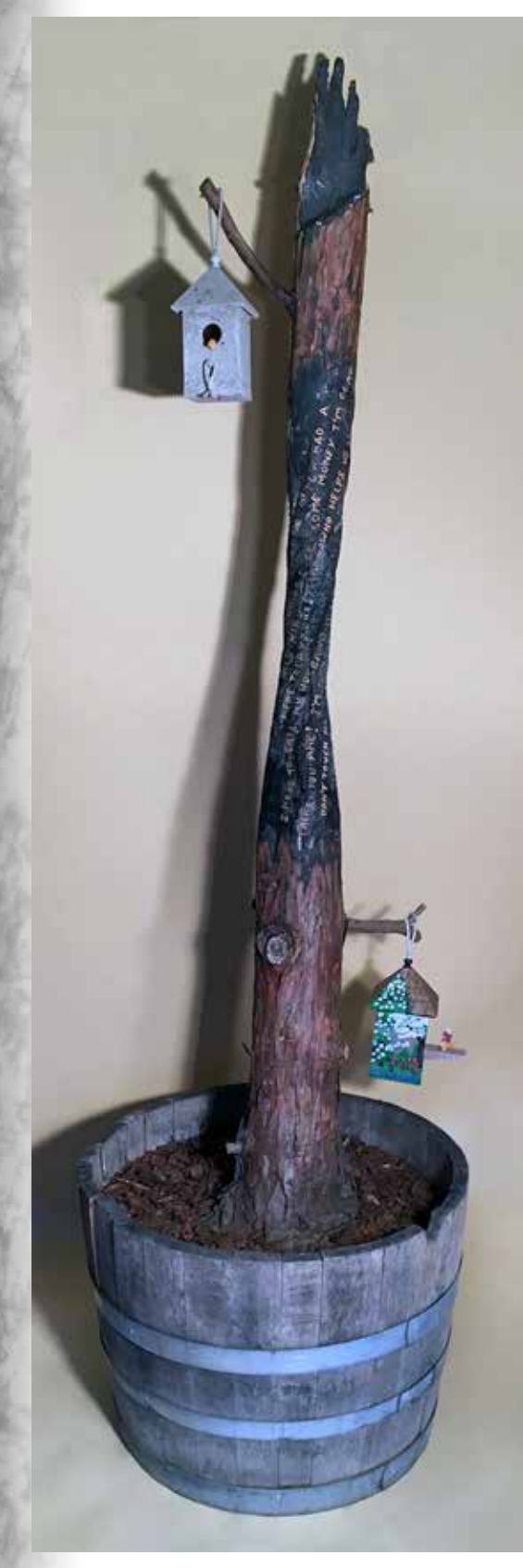
PHOENIX', 94" H X 24" DIA, WOOD, STEEL, WOOD ASH, POLYMER CLAY, ACRYLIC PAINT, BARK, 2016