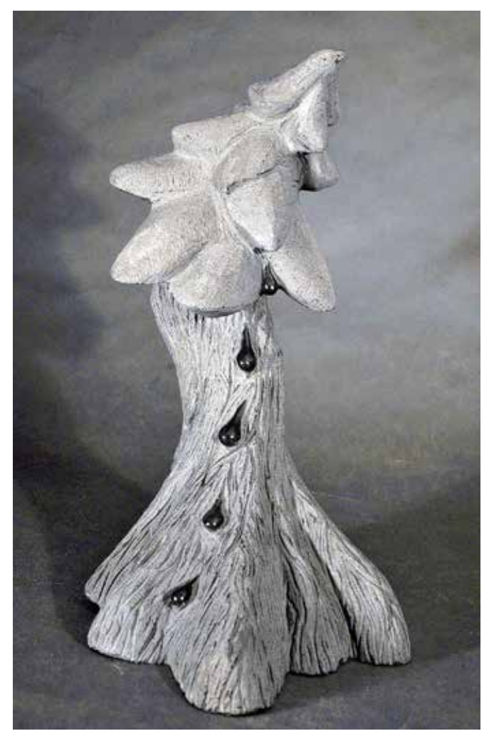
▲ 'THE TREE OF LIFE IS WATERED WITH TEARS', 18" × 14" × 10", BASALT, 2014