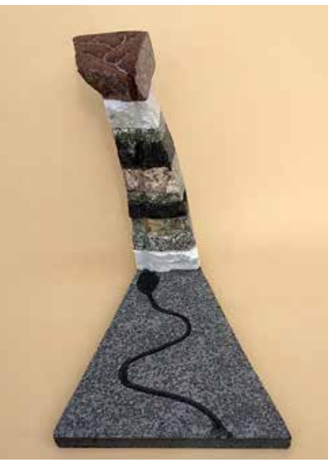
'TIME', 10" x 11" x 8", MIXED STONE, 2019

Completing the series really did yield the hoped for result: I made the transition into another world that is no longer about grief and memory. I imagine that the passage of time has much to do with this outcome, since it's been six years, but I also think that my selfimposed art therapy played an important role. At a minimum, I've been able to transform the lead of grief into the gold of expressive sculpture.