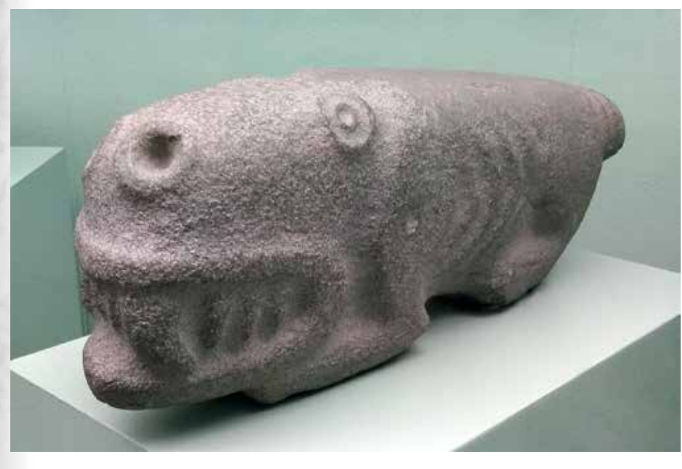
▲ CREATURE CARVING

and was created by Brad Cloepfil of Allied Form Works of Portland, Oregon; this was an early project for Cloepfil and AFW, who have gone on to structural design projects