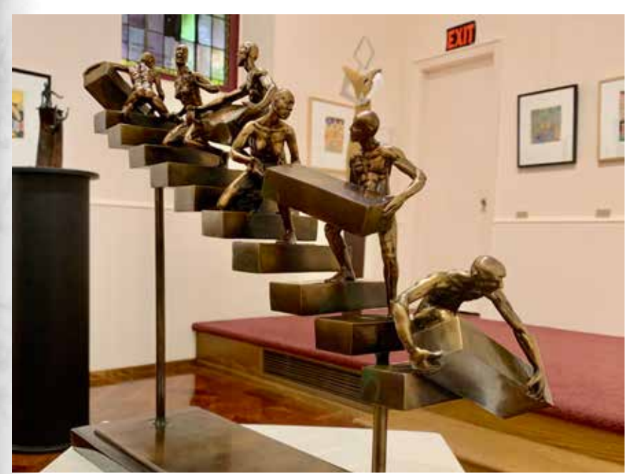
▲ 'PROGRESSION', JASON JOHNSTON

▲ First Congregational Church OF PORTLAND