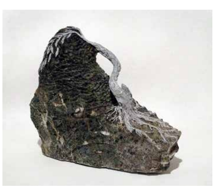
▲ `New World', 9" x 10" x 5", Soapstone, 2014

The first, 'Lost World', is a tree with two trunks emerging from the stone and winding around each other, leading to highly polished foliage flowing back into the rough, pale rock. Its companion piece, 'New World', is a photographic negative of the first work: a pale, shattered, single trunk that rises out of the dark rock and ends in pale, sparse foliage scattered across the top. The first symbolized the richness of my life with Judy while the second was my bereavement in a new world that lacked strength and substance.