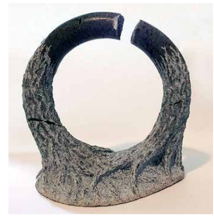
▲ `WILL THE CIRCLE', 12" × 11" 6", OLIVINE, 2014

thinking played a major role: a nub of an idea would start a cascade of related ideas that I then would try to integrate into a coherent whole.