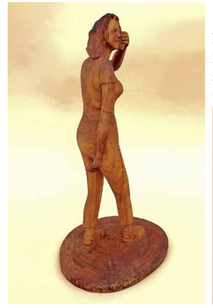
▲ `THE NEW NORMAL', 12" x 6 " x 7", CHERRY WOOD, 2019

▲ 'IF (YOU REALLY LOVE ME)', 14.5" x 8.5" x 6", GRANITE, 2018