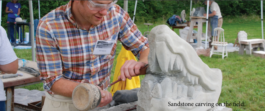
Sandstone carving on the field