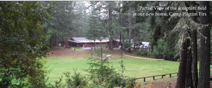
Partial View of the sculpture field at our new home, Camp Pilgrim Firs