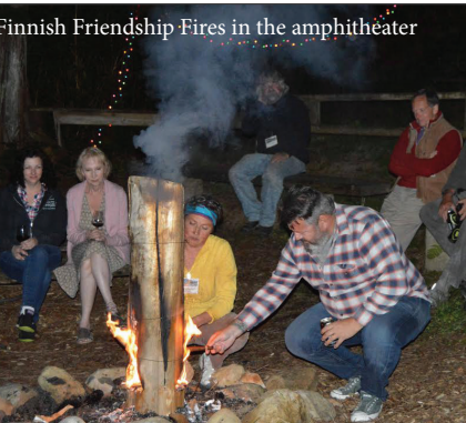
Finnish Friendship Fires in the amphitheater