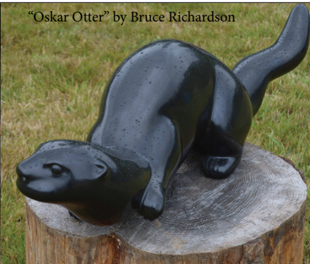
"Oskar Otter"