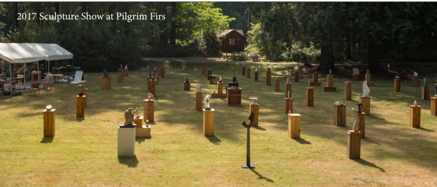
2017 Sculpture Show at Pilgrim Firs