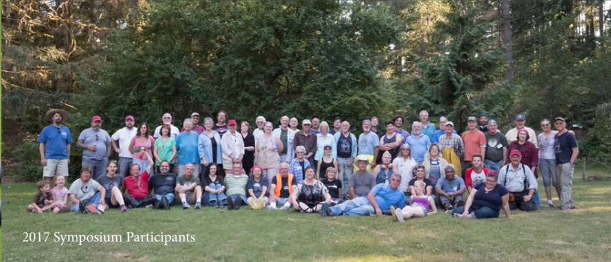
2017 Symposium Participants

31ST ANNUAL INTERNATIONAL STONE CARVING SYMPOSIUM JULY 7-15TH AT AT CAMP PILGRIM FIRS IN PORT ORCHARD, WA